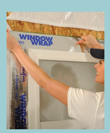
Adhere WindowWrap® to the header flange and directly to the house sheathing. Head section must extend beyond the jamb sections for proper waterproofing.