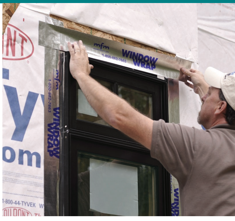
WindowWrap® products are suitable for new construction or home renovation projects. These professional grade products are proven performers and reduce expensive call backs.