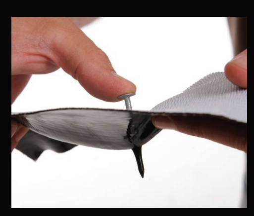
All WindowWrap® products are self-sealing around fasteners such as nails (shown here) and staples to maintain the integrity of the waterproof seal.