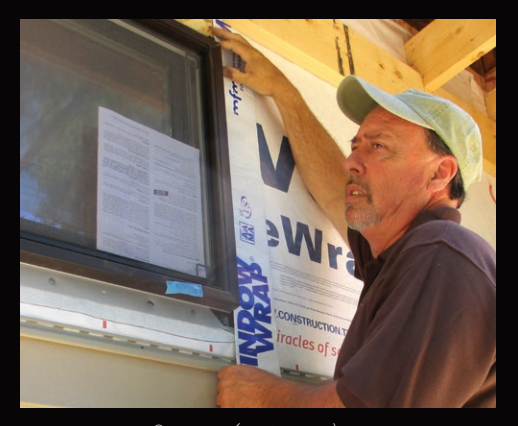
WindowWrap® White (W-3 Tape) is ideal for waterproofing around windows and doors, but also is an excellent choice for sealing building seams and general construction.