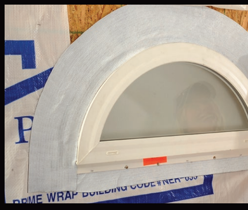
The unique design of WindowWrap® Flex is the ideal solution for sills, arched windows, doors and irregular shapes. This product is impermeable to water vapor, moisture, insects and air.

Call one of our professionals today at 800-882-7663 to get your project on the right track.