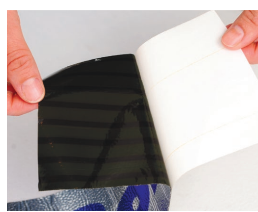
WindowWrap PowerBond® products feature a patented, dual layer/two-component adhesive system that aggressively adheres in low temperatures while remaining stable at higher temperatures.

The easy-to-remove release liner allows for a quick and simple installation. Apply maximum pressure with a hand roller over the entire membrane, paying special attention to any overlaps and seams.