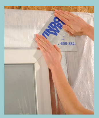
Fold house wrap back over header flange and secure with a piece of WindowWrap®. The self-sealing properties seal around nails, screws and fasteners.