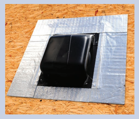
By offering multiple width options, items such as this roof vent can be quickly and easily waterproofed using Peel & Seal®.