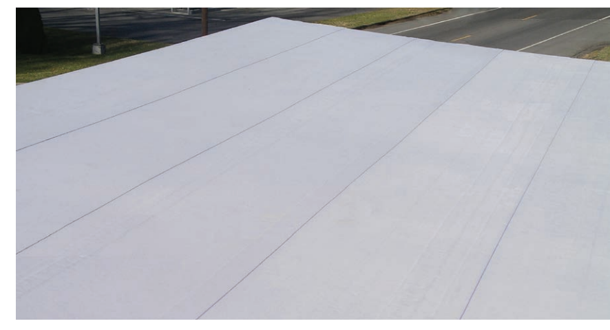
Color options allow Peel & Seal<sup>®</sup> to match your exterior décor where the end result is a neat, clean appearance that offers maximum protection against nature's harshest elements.