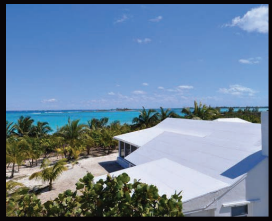
Peel & Seal<sup>®</sup> can be used as a whole-roof waterproof/ weatherproof barrier that requires no coating or covering for exposure to the elements, including direct sunlight.