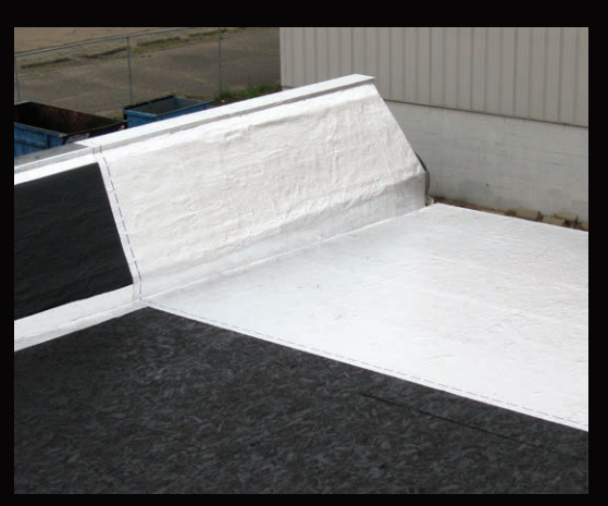
The asphalt compound adheres to most surfaces and seals around fasteners to form a waterproof barrier. A high-quality release liner shields the adhesive surface until Peel & Seal<sup>®</sup> is installed.