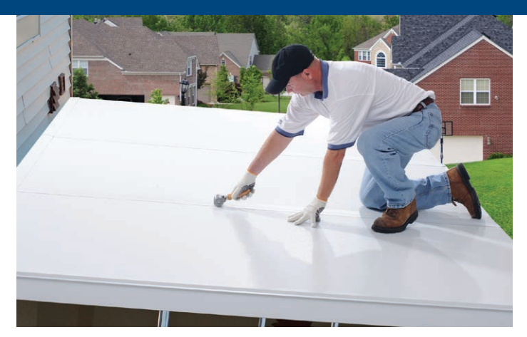
Peel & Seal PowerBond<sup>®</sup> White 250 utilizes the same benefits of Peel & Seal<sup>®</sup>, but is designed specifically to tape seams on insulated aluminum panels.

The key to the effectiveness of Peel & Seal PowerBond<sup>®</sup> White 250 is a highly aggressive adhesive system that is combined with a UV stable outer film to form a long-lasting protective barrier. The product is thinner than Peel & Seal<sup>®</sup>, making it easier to install while having the same performance values. Peel & Seal PowerBond<sup>®</sup> White 250 – the ultimate choice!