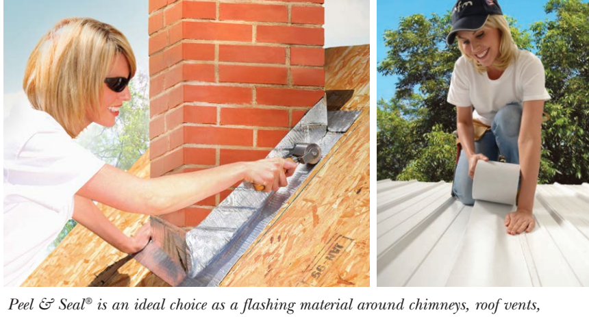
Peel & Seal<sup>®</sup> is an ideal choice as a flashing material around chimneys, roof vents, stack pipes and other difficult to waterproof items. Peel & Seal<sup>®</sup> can also be used to completely cover, flash seams or repair metal roofing systems.