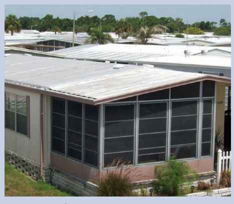
Peel & Seal® is an excellent choice for waterproofing low-slope roof applications and is ideal for mobile homes, trailers, RVs and sunrooms.