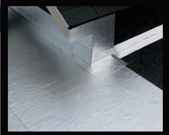
The flexibility of Peel & Seal® allows the product to conform to odd shapes and difficult angles. The unique design of the membrane stretches to accommodate building movement.