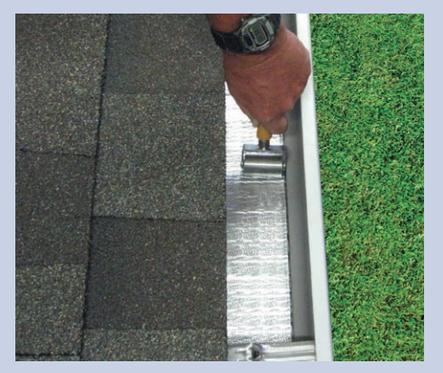
Peel & Seal® is offered in various widths for a perfect fit for patching, gutter repair, flashing and general waterproofing where the membrane is exposed.