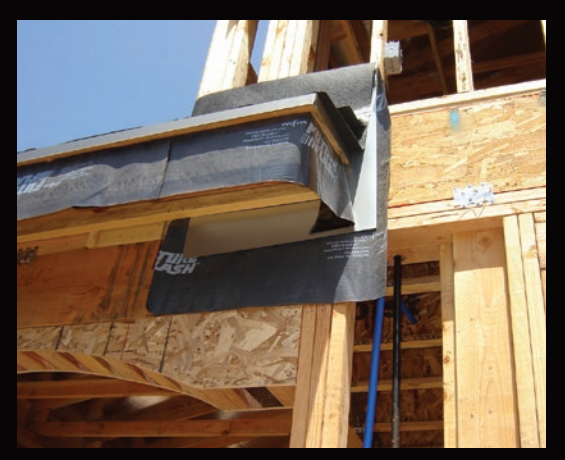
FutureFlash® is an excellent choice for prelining of all metal transitions.

FutureFlash® provides a weep system that channels water to the outside of the building. The membrane prevents leaks in structures of all types and may be used to weatherproof windows, doors, exterior penetrations, or anywhere a dependable waterproofing barrier is needed.