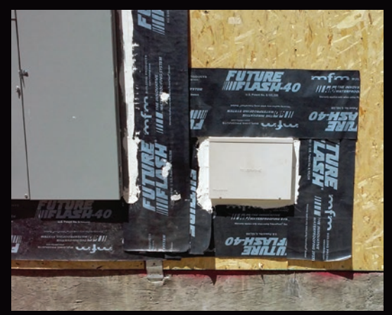
FutureFlash® offers high strength, high elongation and is flexible to accommodate expansion and contraction of the substrate.