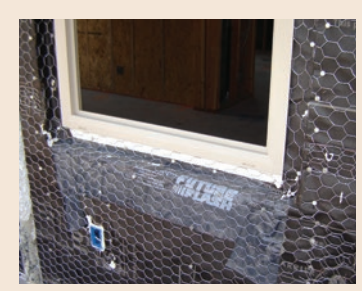
FutureFlash® is ideal to effectively flash complex recessed window assemblies to prevent water damage.