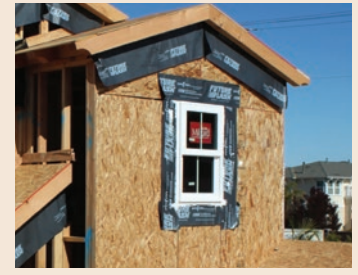
FutureFlash® is designed to create a waterproof and self-sealing envelope in all building applications.

When installed correctly, the FutureFlash® System seals effectively, yet will not trap or promote moisture buildup inside the wall cavity. This helps eliminate the occurrence of wood rot, warping, and particularly the growth of potentially hazardous toxic molds.