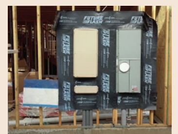
FutureFlash® is an excellent flashing material around vents, electrical boxes and other exterior penetrations.