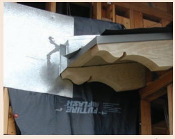
Tough, UV-friendly FutureFlash® prevents leaks at a facia board/wall termination and separates dissimilar metals to prevent corrosion.